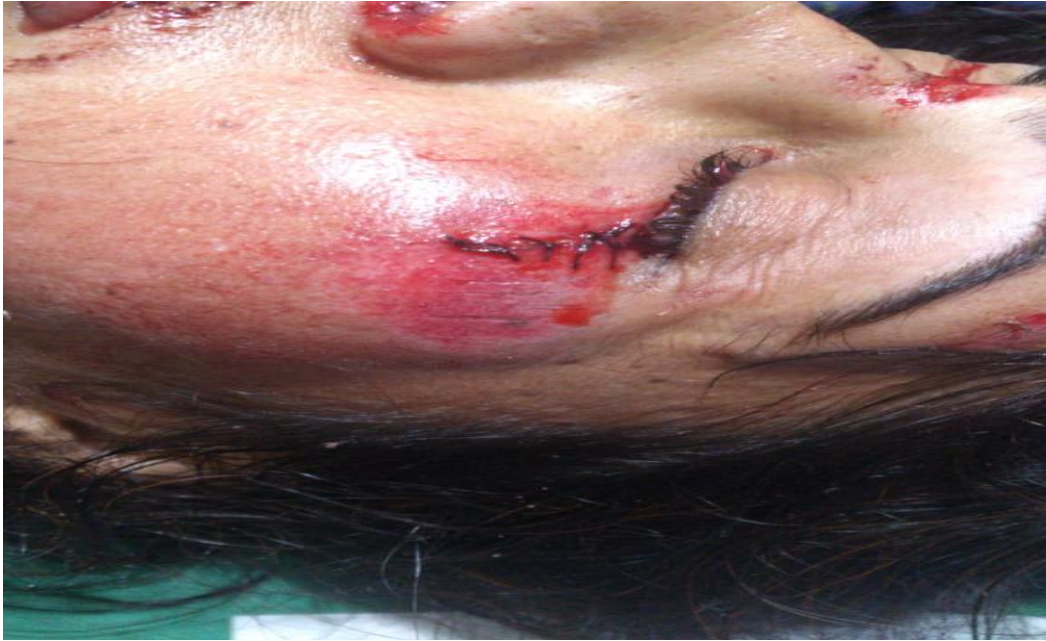
Lower lid laceration sutured