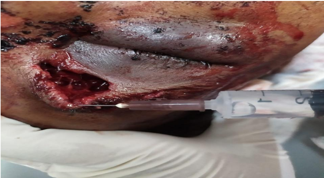
Upper and lower lid ecchymosis