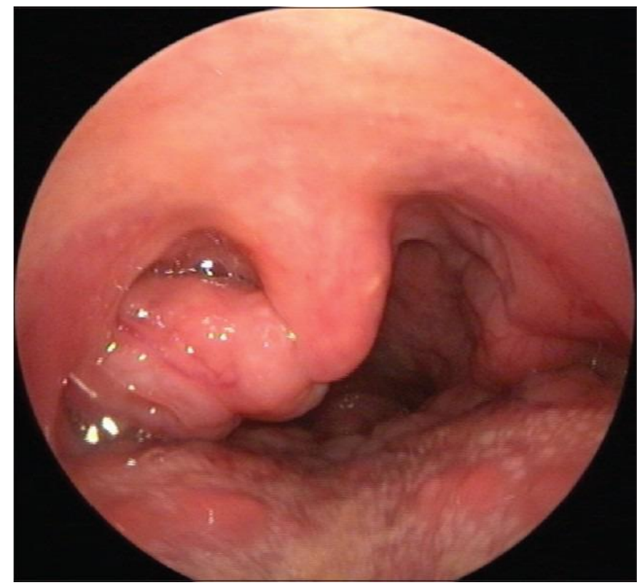
Figure 1: View of the asymmetrical hypertrophy of the right tonsil with a mass arising in its upper pole