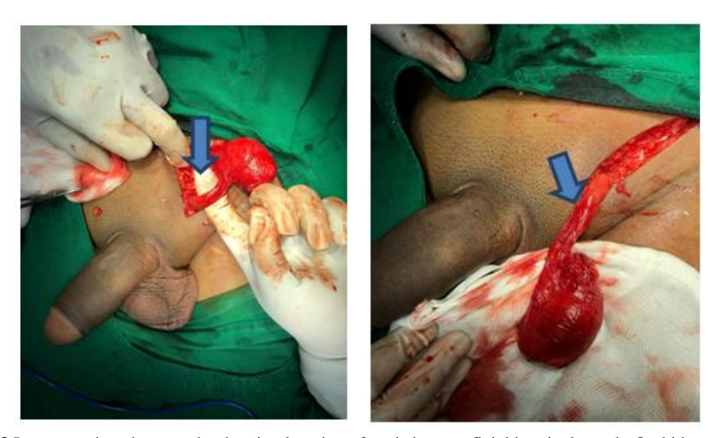
Figure3. Intraoperative photographs showing location of testis in superficial inguinal pouch, Orchidopexybeing performed with repositioning of testis in scrotum.

He was operated for pelvic injuries. Pain reduction of dislocated testis was done with ice packs and NSAIDS. After 2 weeks patient was evaluated again with colour Doppler, dislocated testis showed good vascularity. Surgical exploration and orchidopexywere performed.