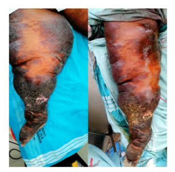
Figure 1: MRI showing cut section of (R) thigh. Figure 2: Pre-excision and Post-excision limb.