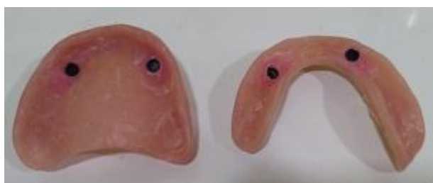
Fig 6- Final overdenture (intaglio surface)