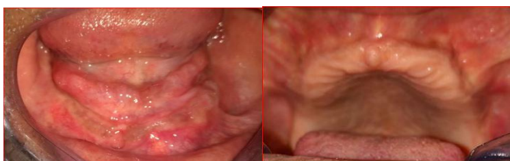
Fig 1- Edentulous maxillary and mandibular arch