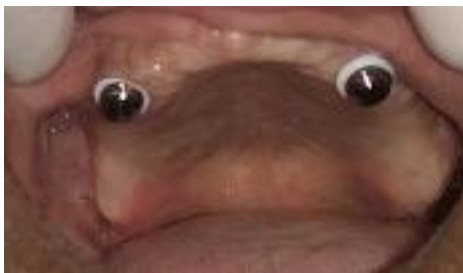
Fig 4- Locator