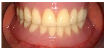
Fig 5- complete denture