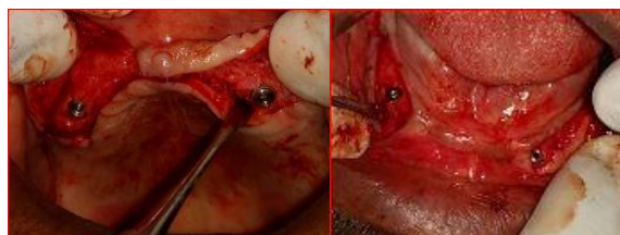
Fig 3- Implant placement in maxillary and mandibular arch