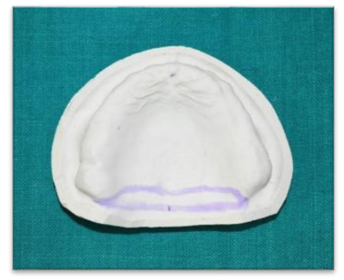
Fig 1: Posterior and anterior vibrating line located

Oral examination was carried out to rule out soft and hard tissue abnormalities. Preliminary impression was made with impression compound. The patient was instructed to rinse the mouth with an astringent mouthwash and then seated in an upright position. The posterior palatal area is dried with gauze. The 'T' burnisher was then placed along the posterior angle of the tuberosity until it drops into the pterygomaxillary notch. The same procedure is performed on the other side. Posterior vibrating line is located and marked using an indelible pencil by asking the patient to say "ah" in short burst in a normal, unexaggerated fashion. Anterior Vibrating Line was located and marked with indelible pencil by asking the patient to say "ah" with short vigorous exaggerated bursts. The patient was instructed to keep the mouth open to prevent smudging of the markings .The preliminary impression made was re-inserted into the mouth and seated firmly, to transfer the indelible lines to the impression (Fig 1 and 2).