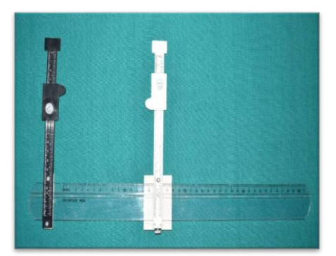
Fig 5: Recording the distance