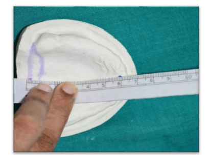
Fig 3: Measuring distance from the cast

The impression was poured with dental plaster. The markings which were transferred from the mouth to the impression were recorded in the diagnostic cast. After the plaster cast was set, the distance from the posterior margin of the incisive papilla to the midpoint of the posterior vibrating line was measured using a flexible scale and the values obtained were recorded (Fig 3).