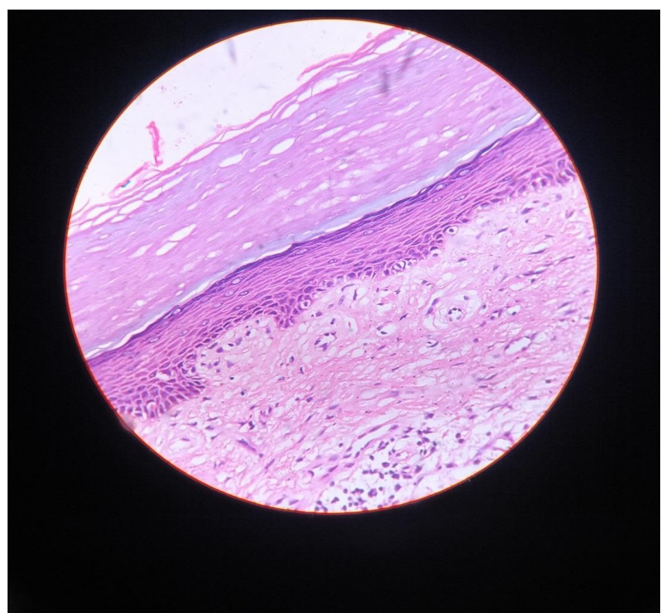
Figure 4 : Histopathology consistent with DLE(hyperkeratosis, follicular plugging, basal cell vacuolation, dermal perivascular lymphocytic infiltrate)