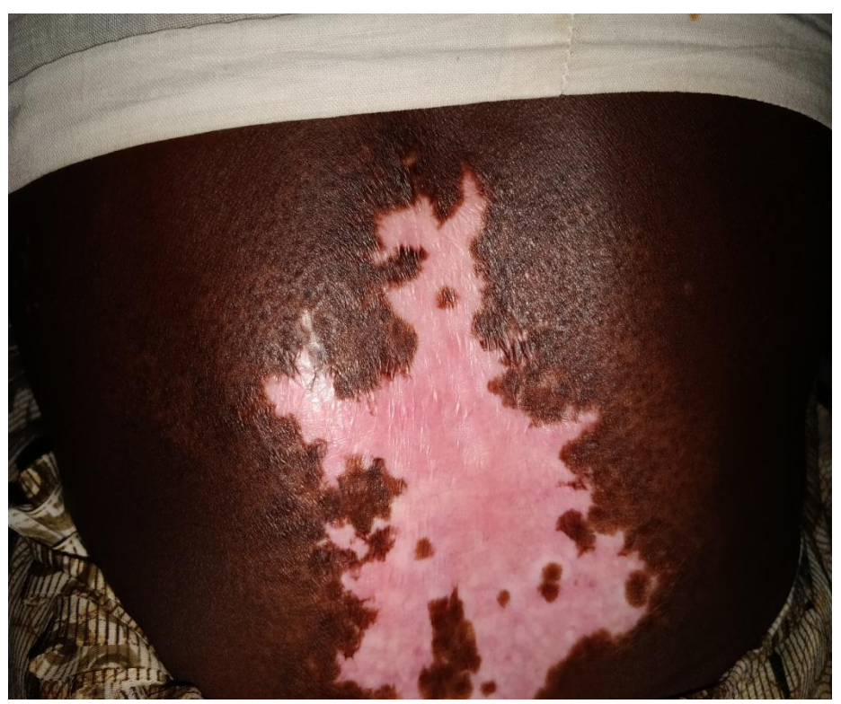
Figure 1: Erythematous atrophic depigmented plaque of DLE on lower back

betamethasone dipropionate, and sunscreen agents for management of DLE while wide excision with skin grafting was done for SCC.