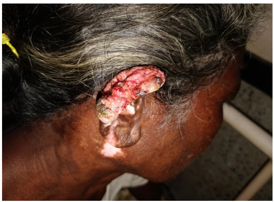
Figure 3: Fungating growth on right eararising on pre-existing plaque of DLE