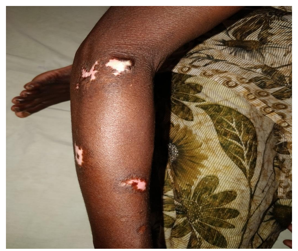
Figure 2: Multiple depigmented erythematous atrophic plaques of DLE on forearm