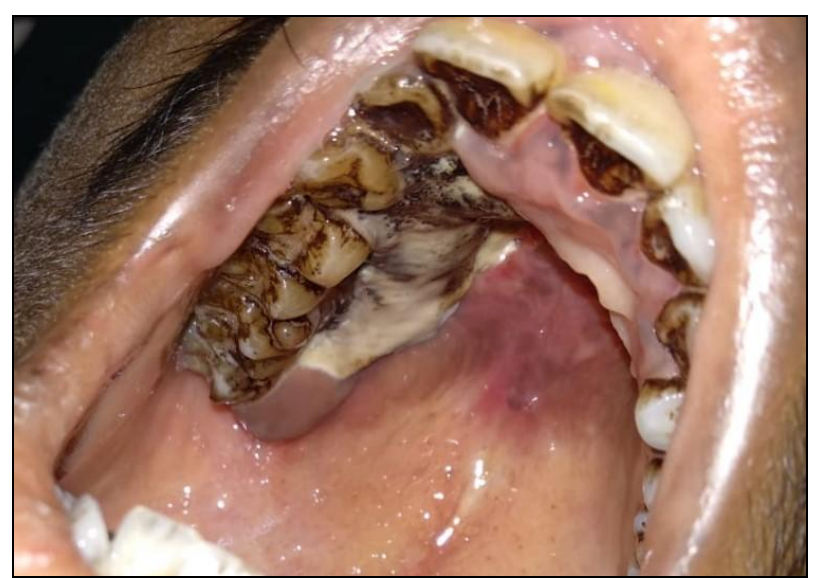
Fig 1: Intraoral photograph showing necrotic slough covering palatal mucosa extending from 17 to 24