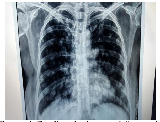
Figure no 1: Chest X-ray showing cannon ball metastasis.

She was investigated and her complete blood picture, renal function tests, liver function tests were found to be within normal limits. Her CA125 levels are elevated (113IU/ml), serum alphafetoprotein, serum CEA, \beta -HCG levels were within normal limits. Serum Lactate dehydrogenase levels were raised. ECG and 2D ECHO were done, no abnormality detected. Chest X-ray showed multiple cannon ball like lesions. CT chest showed multiple well-defined soft tissue nodules of various sizes seen in both lungs involving all the lobes and a well-defined soft tissue mass lesion -7.5x6x4.2cm along the greater curvature of stomach. CT abdomen showed heterogeneously enhancing lesion measuring 14.7x8.5cm in uterus, extending superiorly up to umbilical region and also a metastatic deposit noted in left gluteal region. Endometrial biopsy confirmed the diagnosis of pleomorphic leiomyosarcoma and then we diagnosed her with Uterine Leiomyosarcoma Stage IVB with lung metastasis.