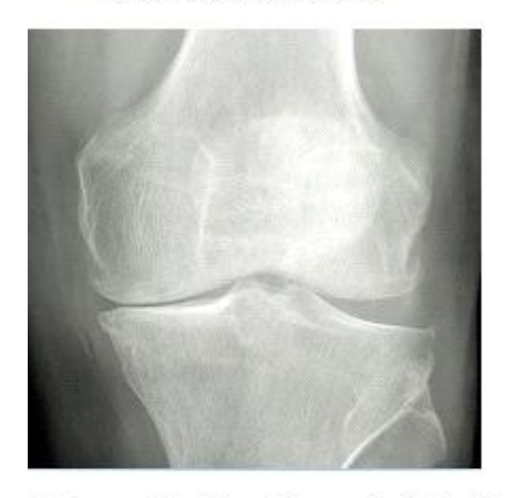
Osteoarthritis of knee joint with Ahlback's radiological grade I