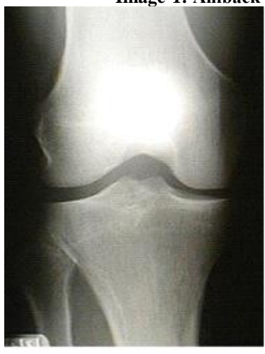
Nomal knee joint

Image-1: Ahlback's radiological grading of Osteoarthritis of knee joints.