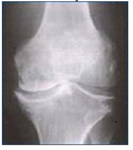
Osteoarthritis of knee joint with Ahlback's radiological grade III