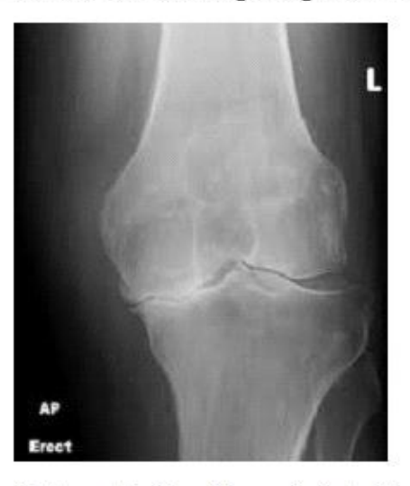
Osteoarthritis of knee joint with Ahlback's radiological grade IV