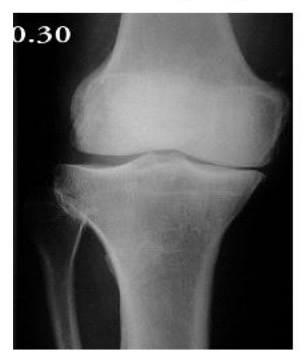
Osteoarthritis of knee joint with Ahlback's radiological grade II