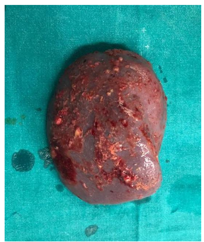
Fig 2 showing the specimen