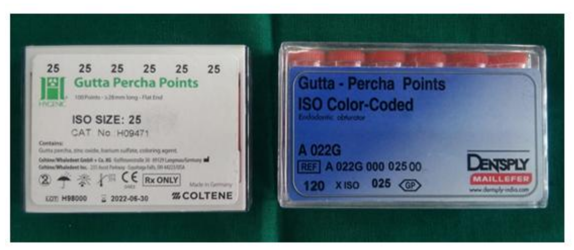
Fig 1.25 sizes of two different manufactures of gutta-percha cones Dentsply and Coltene

forcepand added to a tube containing 1.5 mL saline. Volumes of 500\mu L were pipetted outand processed for culture in two different culture media namely, Blood Agar and MacConky culture media. They were aerobically incubated in an incubator at 37^{\circ} C for 24 hours. (fig .2). Colony growth reading was taken after 24 hours of culture.