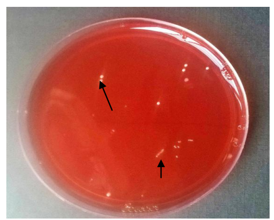
Fig:4 Growth of two different organism,