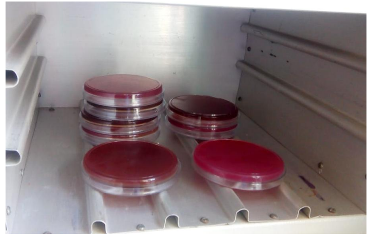
Fig: 2. Culture plate in an incubator

The same method was performed on day two and day three of opening the sealed packet, following all the aseptic measures and the microbial colonies were counted under the microscope in the lab.If any growth was noted on the culture plate, the bacterial colonies were counted and processed for microscopic examination for identification of microorganism by gram staining method.