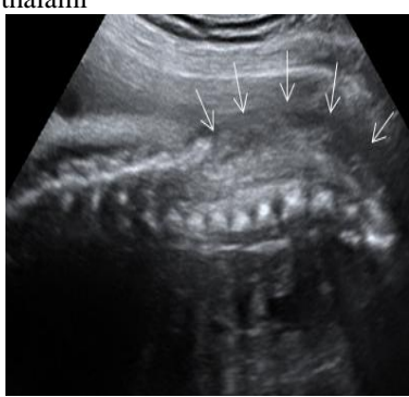
Figure (2a): 2DUS (sagittal view) of the fetal spine shows Large defect at lumbar region containing meninges and neural elements (arrows).