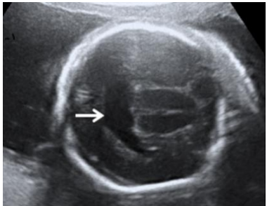
Figure (1a):2DUS (Axial view) showing fusion of lateral ventricles (arrow) with fused thalami

The third patient (figure 3)aged 26 years (P 2+0), gestational age was 27 weeks + 2 days and negative consanguinity. The diagnosis was an encephaly.