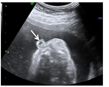
Figure (1b): 2D US of the same case Showing single nasal aperture (single nostril) (arrow).