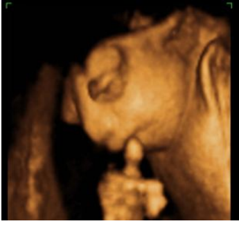
Figure (3b): 3DUS of the headconfirm the diagnosis of anencephaly