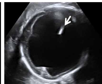
Figure (2c): 2DUS (axial view) of the brain shows markedly dilated lateral ventricle with preserved falxcerebri (arrow).