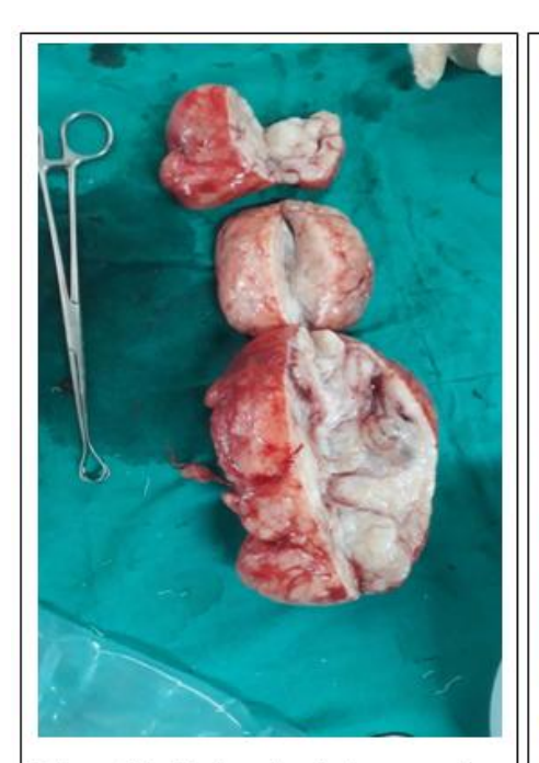
Figure No. 3 showing intra operative cut section of three huge fibroadenomas with size range from 5x5 cm, 6x6 to 7x6 cm