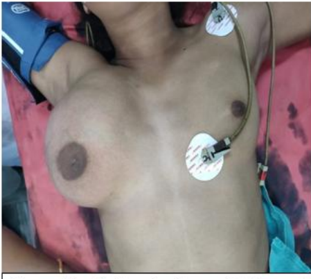
Figure No. 1 showing large right breast with apparent breast asymmetry and with prominent veins.

After discussion with the patient and the family members, the Lumpectomies of right breastwere donewith an infra-mammary skin incision. In the right breast, threegiant fibroadenomas were excised, with size ranging from 5x5 cm, 6x6cm and 7x6 cm (Figure No. 3). After resection of all the lumps, oncoplasticrepair of the breast done to restore the breast shape and establish bilateral breast symmetry (Figure 4). The pathology confirmed right giant fibroadenomas with good prognosis(Figure 5). On post-operative period, patient recovered well, with no complications. Drain removed on firstpost-operative day and discharged. On follow up, the results were cosmetically acceptable without further interventions and patient showed no signs of recurrence or comorbidity.