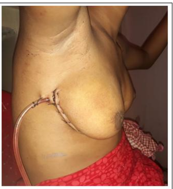
Figure No. 4 post-operative image showing sutured infra mammary incision and vaccum drain placed.