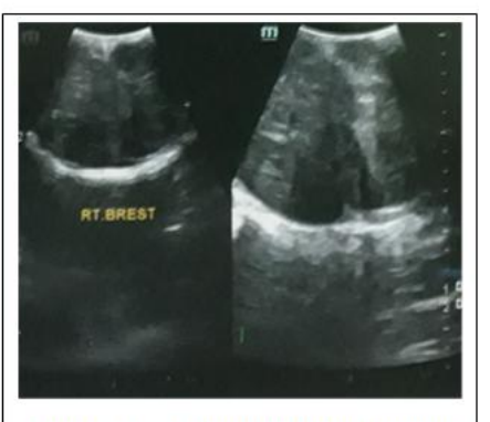
Figure No. 2 showing ultrasonogram image of right breast.