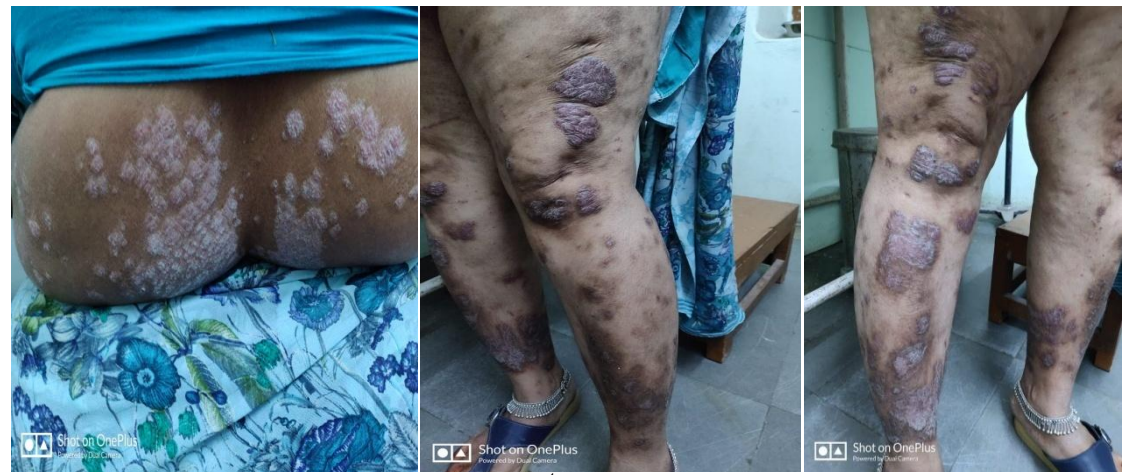
Figure 3: Psoriasis patient after 1st week treatment with Apremilast