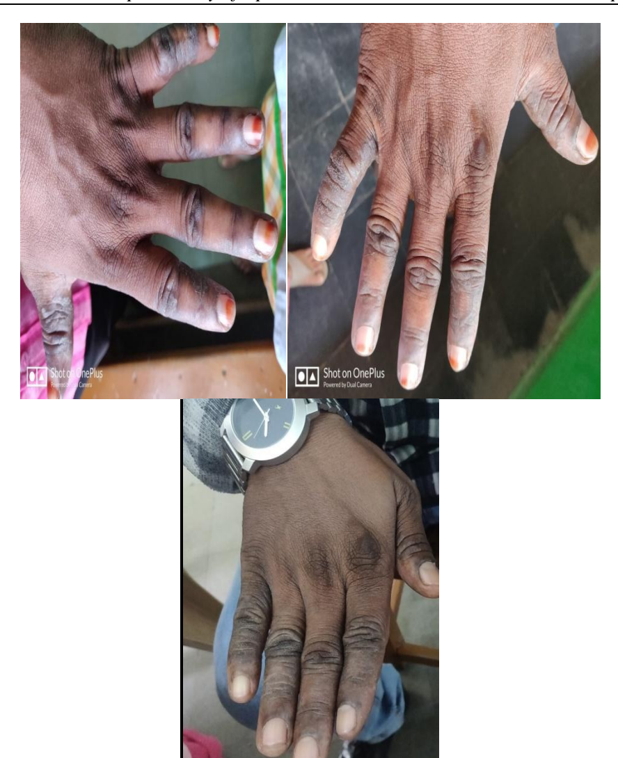
Figure 6: Psoriasis patient after 1<sup>st</sup>, 2<sup>nd</sup> and 12weeks treatment with Apremilast