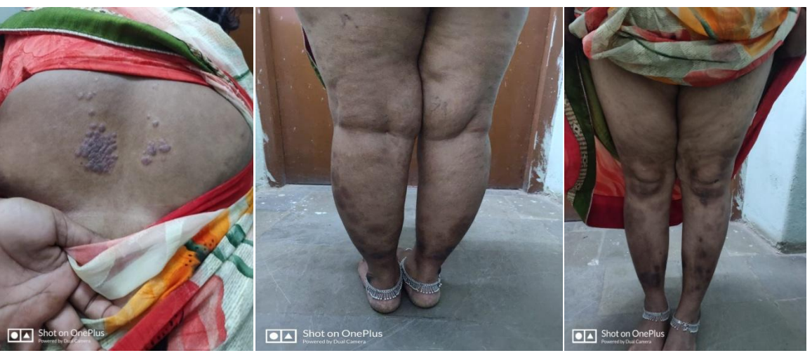
Figure 5: Psoriasis patient after 16weeks treatment with Apremilast