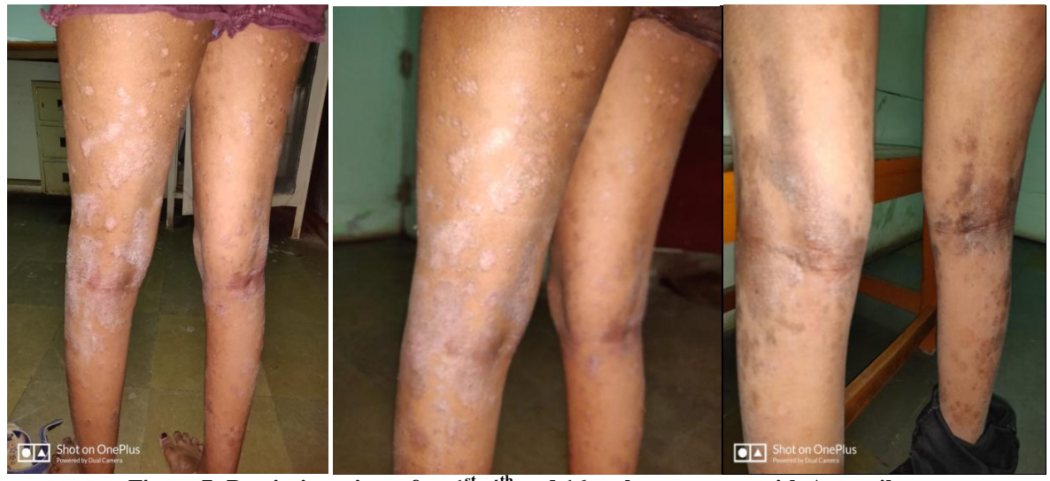
Figure 7: Psoriasis patient after 1st, 4th and 16weeks treatment with Apremilast