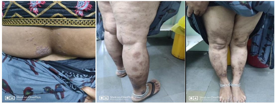
Figure 4: Psoriasis patient after 12weeks treatment with Apremilast