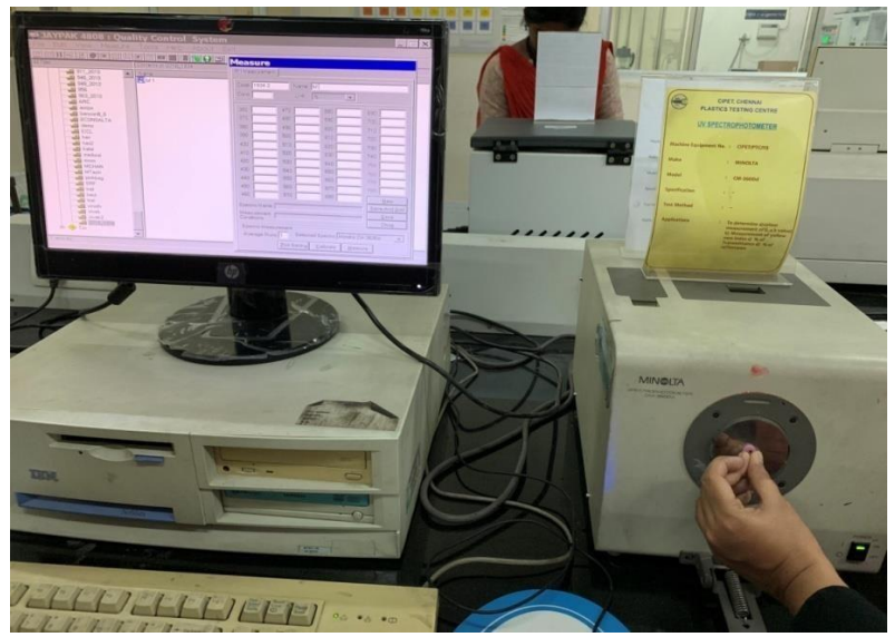
(Fig 4) Spectrophotometer

CM-3600d Spectrophotometer was used to measure the Commission International de l'Eclairage (CIE) colour parameters L*, a*, b* of each sample in wavelength 360-740 nm using D 65 Illuminant and observer function at 10°. The samples were dried using a hair dryer and held against the aperture using the sample holder