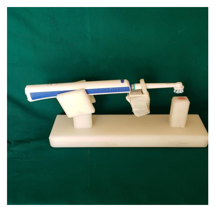
(Fig 5) Brushing cycle – customized brush stand with electronic tooth brush and sample

A custom-made brushing apparatus was designed and built for this study. An electronic tooth brush (PRO 600, Oral B) was fixed in horizontal position over a plastic holder and secured onto a flat base. The brush was operated at 48,000 rpm. A weight of 200gm was suspended from the shank of the brush. A small well was built to retain the samples in contact with the brush head during brushing. The brush was fixed so that the brush head position was consistent between samples and was fully charged each time. The brush head was replaced for a new one every 5 samples within the same group. To simulate one year of wear a total of20min brushing per sample was undertaken