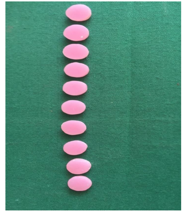
(Fig 1) PMMA Heat cure denture base resin samples (ungrouped).

Comparative Evaluation of the Effect of the Tooth Brushing On the Surface Roughness and Colour ..