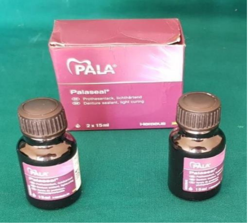
(Fig 2) Denture surface sealant (Palaseal)

Ten samples were blow dried using a hair dryer. The dried samples were coated with Denture surface sealant (Palaseal)