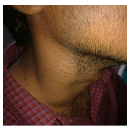
Fig 1-Pre-Op picture showing lymph node enlargement at level 2 station on the right side of the neck.