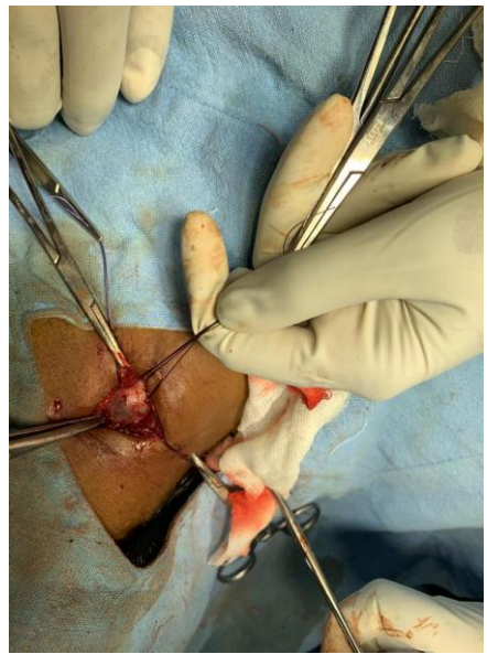
Fig 2-Intra Op picture of the lymph node.

TREATMENT:Complete surgical excision provides cure of the disease with no reported cases of recurrence in solitary mass form(UCCD).In IMCCD corticosteroids have been used to palliate symptoms before starting aggressive systemic chemotherapy. Monoclonal antibodies targeting CD-20 on B-cells (Rituximab) have been tried as a single agent as well as in combination with chemotherapy [6]. Highly active antiretroviral therapy (HAART) improves survival in HSSV-8 associated MCCD with HIV co-infection [6].