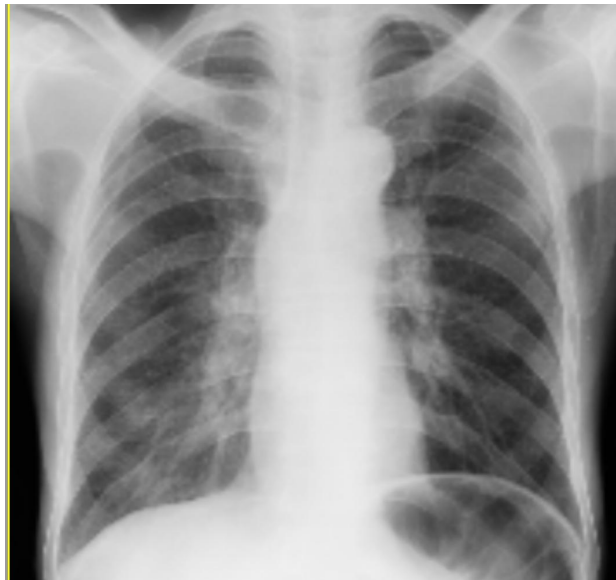
Figure -1: CXR (PA) View showing features of Emphysema and heterogeneous infiltrations in the right lower zone.

After the diagnosis of COP, 60 mg/day prednisone was administered ,symptoms started improving, with the dosage tapering from 60 mg to 40 mg daily, Consequently, the patient's condition improved, and the patient improved dramatically and was discharged with oral prednisolone 40 mg for 6 months with tapering doses .