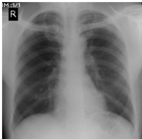
Figure-3: CXR after 2 months follow-up showing clearing of infiltrates.