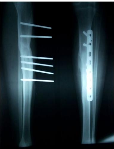
Fig 5: Radiological evidence of union with callus formation

Fig 4: Post-op X-ray showing correction of length, alignment and rotation with rigid fixation.