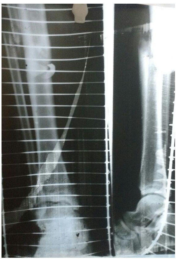
Fig 1: Preopertive X-ray of fracture shaft of tibia

Statistical analysis was done using SPSS software (version 21.0). Mean, standard deviation and the distribution of each variable was calculated.