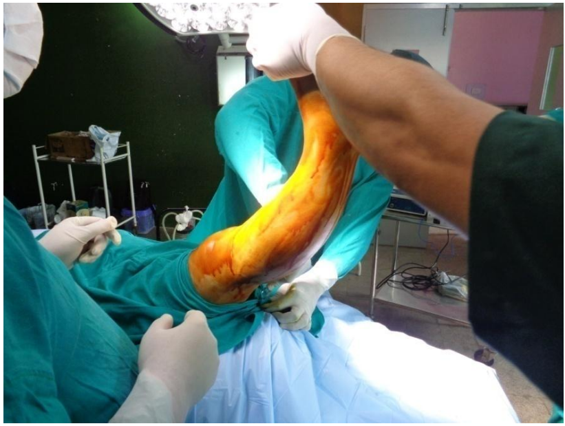
Fig 2: Paintinting before surgery