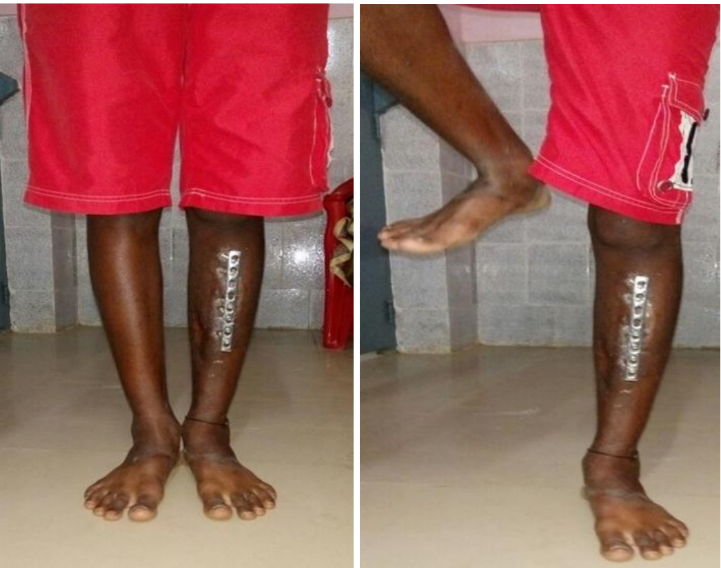
Fig 6: Unsupported full weight bearing at 12<sup>th</sup> week

A study of Locking compression plate as external fixator in the definitive management of open ..