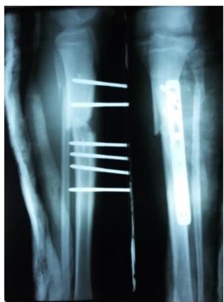
Fig 4: Post-op X-ray showing correction of length, alignment and rotation with rigid fixation.