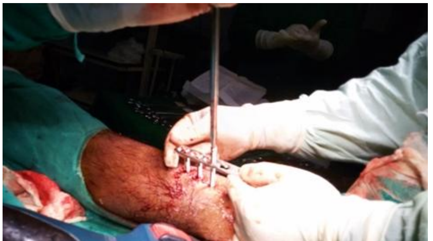
Fig 3: Introduction of screws through LCP after wound debridement and fracture reduction