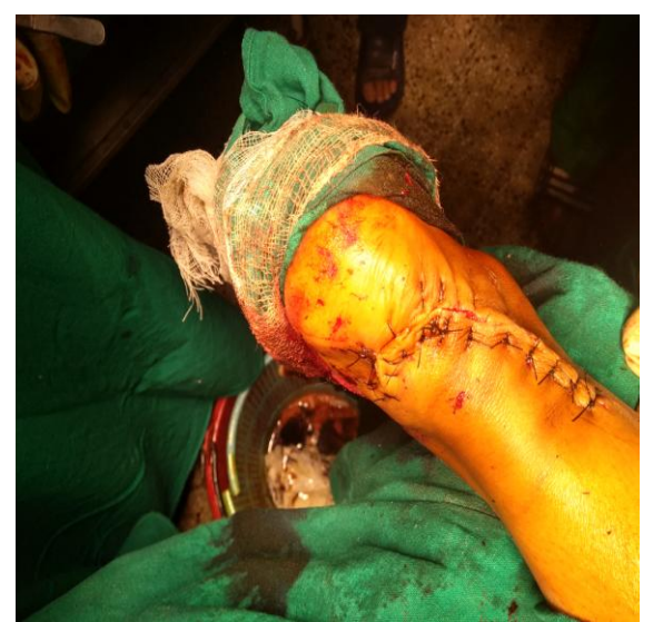
Fig5: Showing Closure of wound