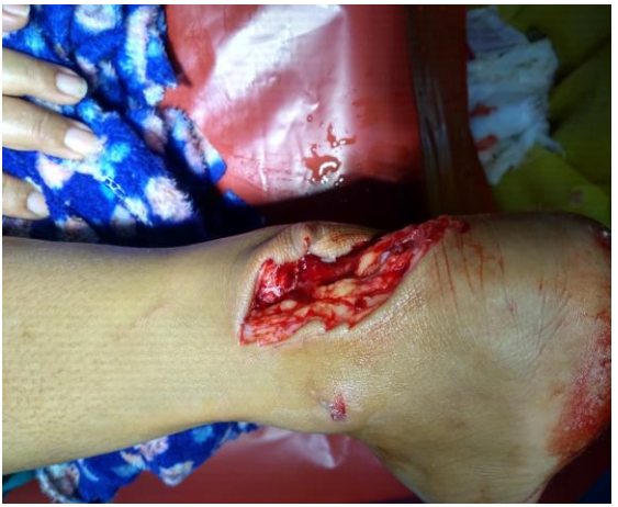
Fig1: Lacerated wound with complete tear of Tendo -Achilles

They were mobilized on non-weight bearing crutches for first 4- 6 weeks followed by gradual weight bearing and range of motion exercises. Follow-up was done at around 2, 4, 8 and 12 week intervals until complete wound healing and satisfactory rehabilitation outcome. The casts were removed in all the patients at 8 weeks in the OPD.