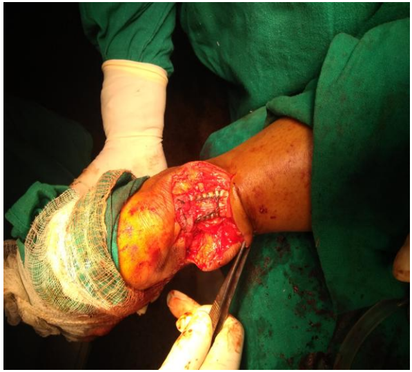
Fig4: Showing final repaired tendo-achilles