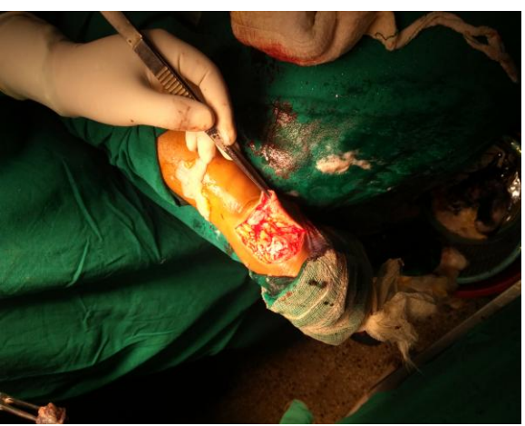
Fig 2: Intraoperative assessment of wound