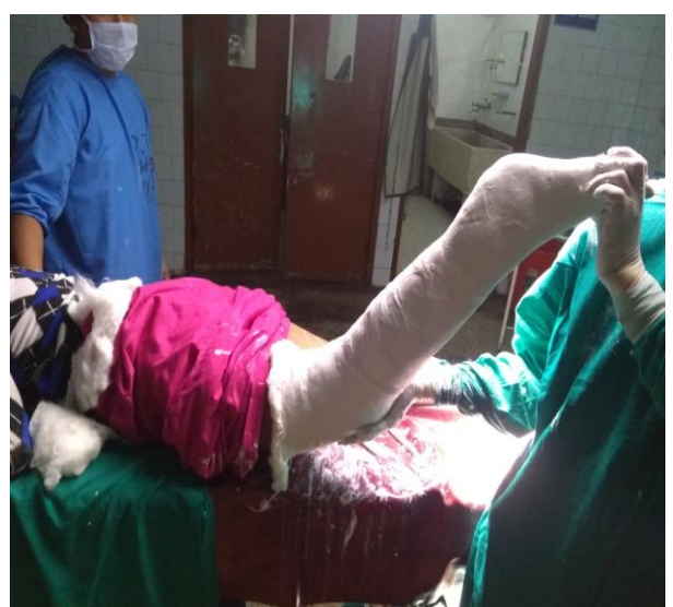
Fig6: Showing application of above knee cast in slight flexion at knee and planter flexion at ankle