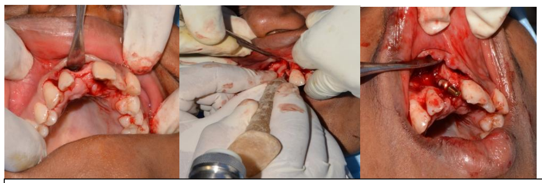
Figure 4.Incision and Flap Elevation, Figure 5. Osteotomy, Figure 6.Implant Placed By Palatal

The patient received antibiotic prophylaxis one hour prior to surgery. Following intra and extraoral antisepsis and local anesthesia (2% lignocaine), a crestal incision was executed along the maxillary alveolar ridge from the mesial side of tooth 12 to the mesial side of tooth 21 extending as sulcular incision on either side (fig 4). A full-thickness mucoperiostealflap was reflected till the mucogingival junction to expose the native bone. The osteotomy site was prepared using customosteotomes (fig 5) and Implant was placed using a palatal approach and locked at its apical one third (fig 6). Due to the severely attenuated thickness of theedentulous space in maxilla, labial 2/3^{rd} of the threads of implants were exposed which was to be covered by the bone graft.