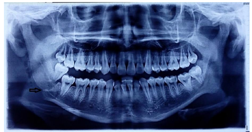
Fig 1. Preoperative OPG showing fracture of right angle of mandible (black arrow).

Preoperative evaluation of the patient: All the patients were examined according to standard protocol after evaluation of maxillofacial trauma patients and noted on specially designed case sheets. The preoperative OPG (Fig. 1), postero-anterior view of the skull (Fig. 2) and preoperative ultrasonography (Fig. 3) were taken in the Department of Oral Medicine and Radiology, DR. Z. A. Dental College and Department of Radiodiagnosis, Jawaharlal Nehru Medical College and hospital Aligarh Muslim University, Aligarh. Postoperative ultrasonography (Fig. 4) was also done to find out the reduction or orientation of fractured segment after open reduction and internal fixation.