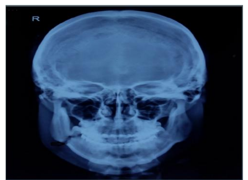
Fig 2. Preoperative postero-anterior view of the skull showing fracture of right angle of mandible (black arrow).

Ultrasonography of the mandibular fracture was performed with a 10MHz linear transducer (Sonoline G 40, Siemens Medical Solutions Germany).