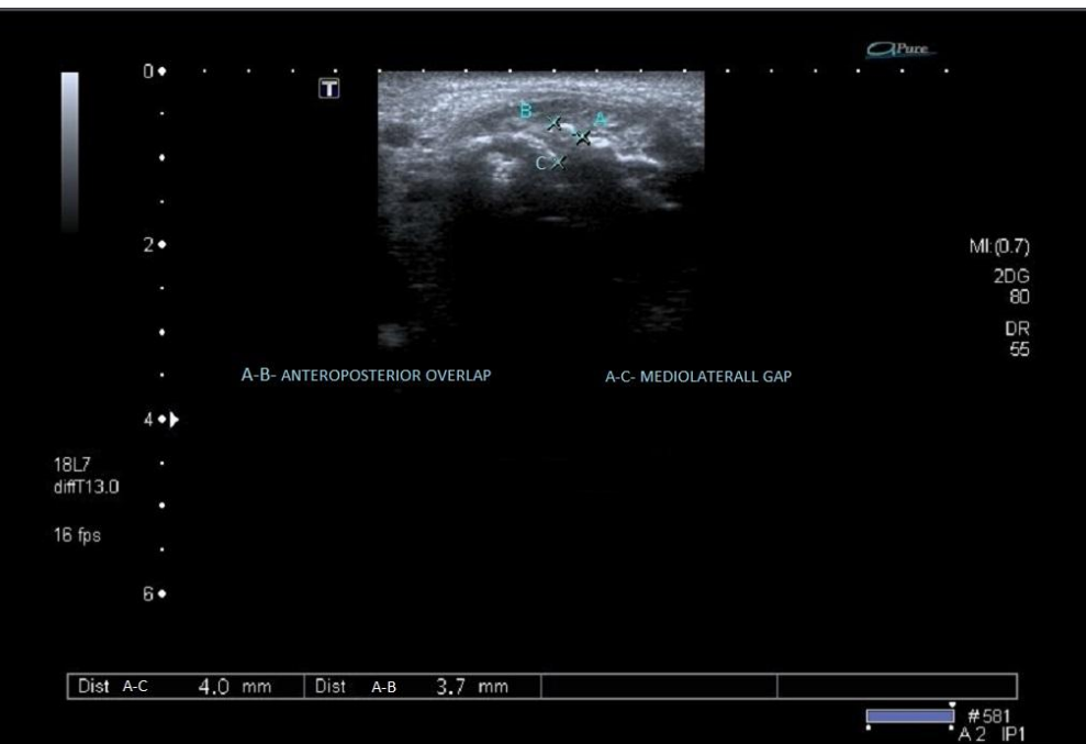
Fig 3. Preoperative ultrasonography showing displacement in fractured segments.

Patients were asked to sign a consent for their willingness to participate in the study, if conscious and adult, or by his/her attendant/ guardian, if unconscious or a minor.