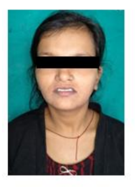
Fig. 12: Confident Patient with smile correction