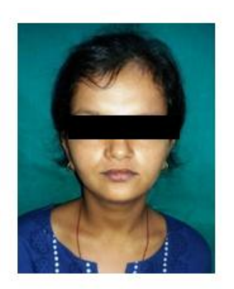
Fig. 1 pretreatment front view of patient

upper arch revealed missing all permanent teeth except 11, 21 and Retained maxillary deciduous teeth are B C D E. In lower arch missing teeth was 31 and 41. The patient's diagnosis was done as hypohydroitic ectodermal dysplasia. Main features of hypohydroitic ectodermal dysplasia was found in patient; frontal bossing, less hair (hypotrichosis), congenitally missing teeth (hypodontia), lack of breast development. Thus On the basis of patient's current condition; a simplified treatment approach was planned. On radiographic investigation it was found that deciduous teeth should not be extracted and can be used as abutment. Individual crown is planned on permanent teeth 11, 21 and deciduous teeth B, C, D, and E. in mandibular arch 4 unit fixed bridge is planned on 32 and 42 to restore 31 and 41.(Fig. 1, 2, 3)