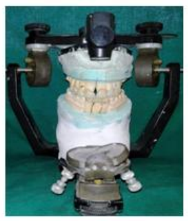
Fig. 9:- Final prosthesis on semi-adjustable articulator