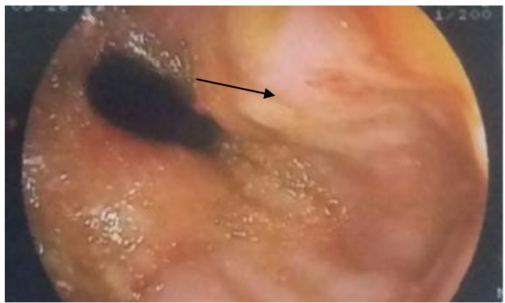
Fig1: Esophagogastroduodenoscopy (EGD) revealed a 20-mm elevated lesion with ulceration of the gastric antrum