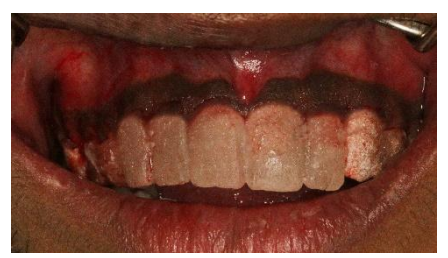
Fig. 4: Stent prepared for crown-lengthening procedure