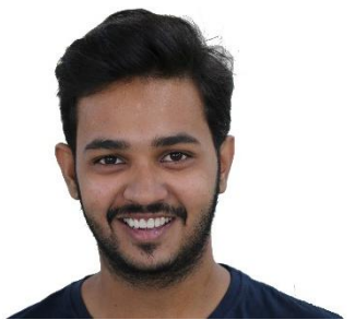
Fig 10: After Prosthesis