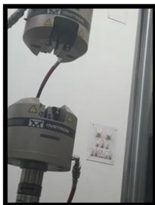
fig.2: Universal Testing Machine- Instron