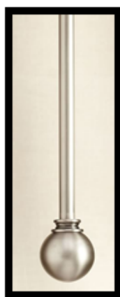
fig.3: testing tool with stainless steel ball head (3mm)