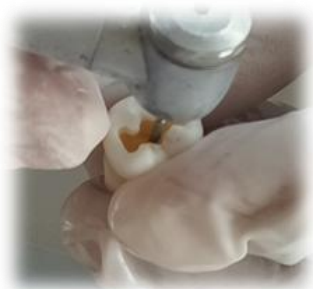
fig.1: cavity preparation