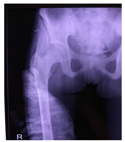
Figure 2. Healing after 3 weeks