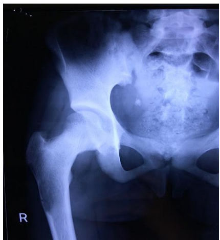
Figure 1. Pathological fracutre