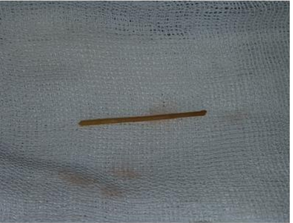
Figure 6: Removed Toothpick, about 6 cm in length