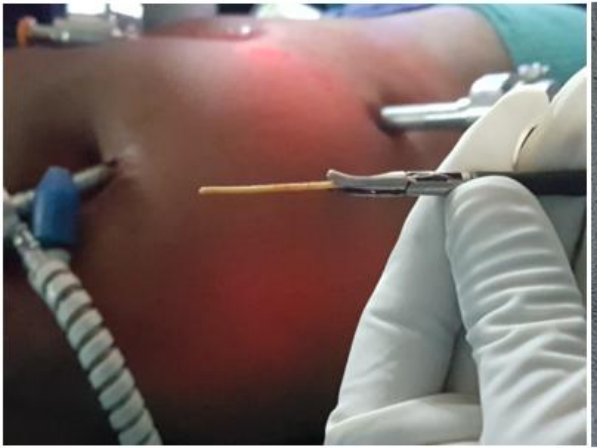
Figure 5: After removal