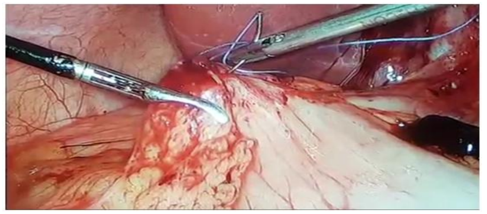
Figure 7:Intracorporeal Suturing of first part of duodenum