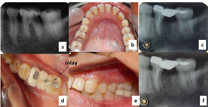
Figure 3: (a)preoperative IOPAR,(b)preoperative photograph showing carious lesion below CEJ,(c)post operative IOPAR after 6 months(d)photograph after prosthesis placement,(d)prosthesis in occlusion,(e)IOPAR after 12 months.

also known as <u>Fixed Movable Partial Denture</u>, it is a dental prosthesis where the artifical tooth or teeth is rigidly supported on one side, usually on the distal end by one or more abutment teeth. On the other side, one abutment will have an intracoronal or extracoronal attachment which allows a small degree of movement between the rigid component and the other abutment. (Figure 3)