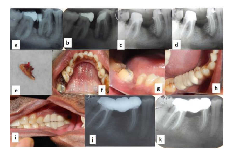
Case 2: Hemisected tooth act as abutment tooth to replace a congenitically missing premolar

A 24 year old female patient came to our department with pain in left lower back tooth .On radiographic examination it was found the there was furcal perforation and calcified mesial canal along with obturation done in the furcation area with furcal and periapical radiolucency with respect to 36 .Retreatment was planned for the patient with the removal of gutta percha and to negotiate calcified canal but was not accessable so hemisection of the mesial root was planned. All the procedure was done like in the above case. The patient was recalled after 1,6 months before giving final prosthsis.the final prosthesis includes hemisected tooth contured to a shape of a molar with minimal cuspal inclines and smaller occlusal table to reduce stress which would acts as an abutment to support a congenitally missing premolar pontic along with the support of 34. (figure 2)