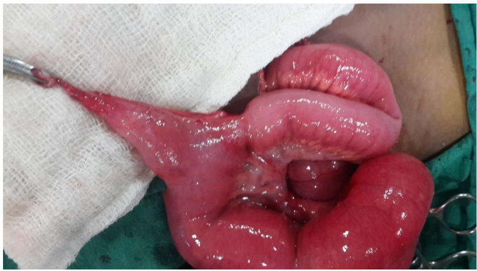
Fig 3 Meckel's with band

Identify complications such as perforation and small bowel obstruction, however there are no findings which are specific enough to confirm or exclude the possibility of Meckel's Diverticulum on plain radiographs.