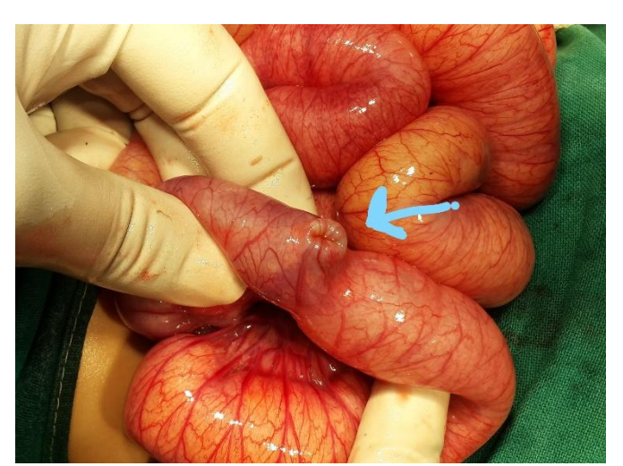
Fig 1 mackel's as lead point

With the exception of the paediatric patient presenting with lower gastrointestinal bleeding, differential diagnosis for any other patient group presenting with abdominal complaints, diagnosisis usually made intra-operatively, therefore pre-operative history, exam findings and supportive imaging's are essential tomaking a timely diagnosis. Plain radiographs may help