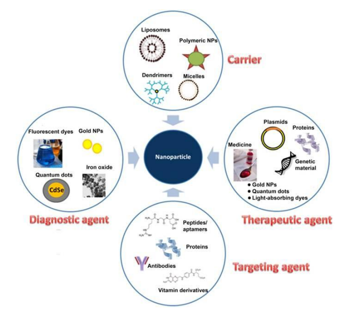
Figure 1: Components of nanoparticle based drug delivery system The Best and First Theranostic Agent

In 19^{\text{th}} century it was the Iodine 131 identified as best theranostic agent in the treatment of thyrotoxicosis. This isotope when radiated to the patient it not only identify the benign condition but also helps in the treatment of thyroid cancer.<sup>7</sup>