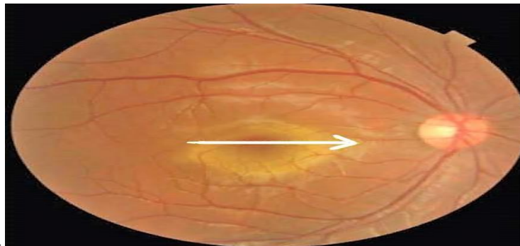
Fig 1.Right eyefundus photograph of 35 years male showing retinal opacity at the macula.