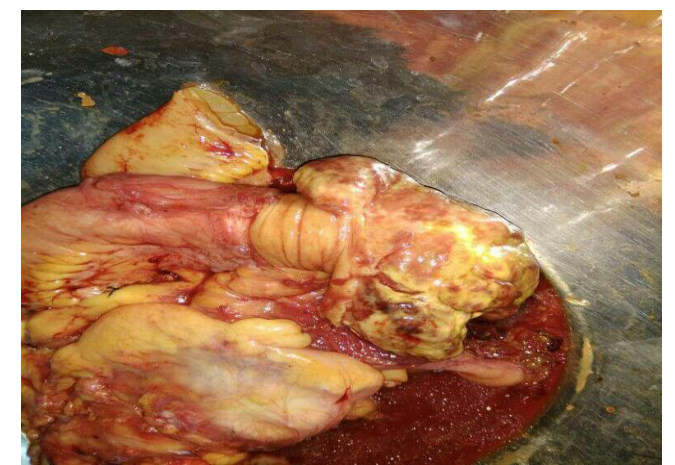
Figure 2 – Resected specimen