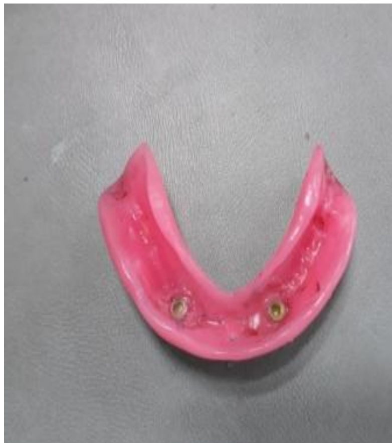
Fig 6: Intaglio surface of denture with metal housing and O-rings