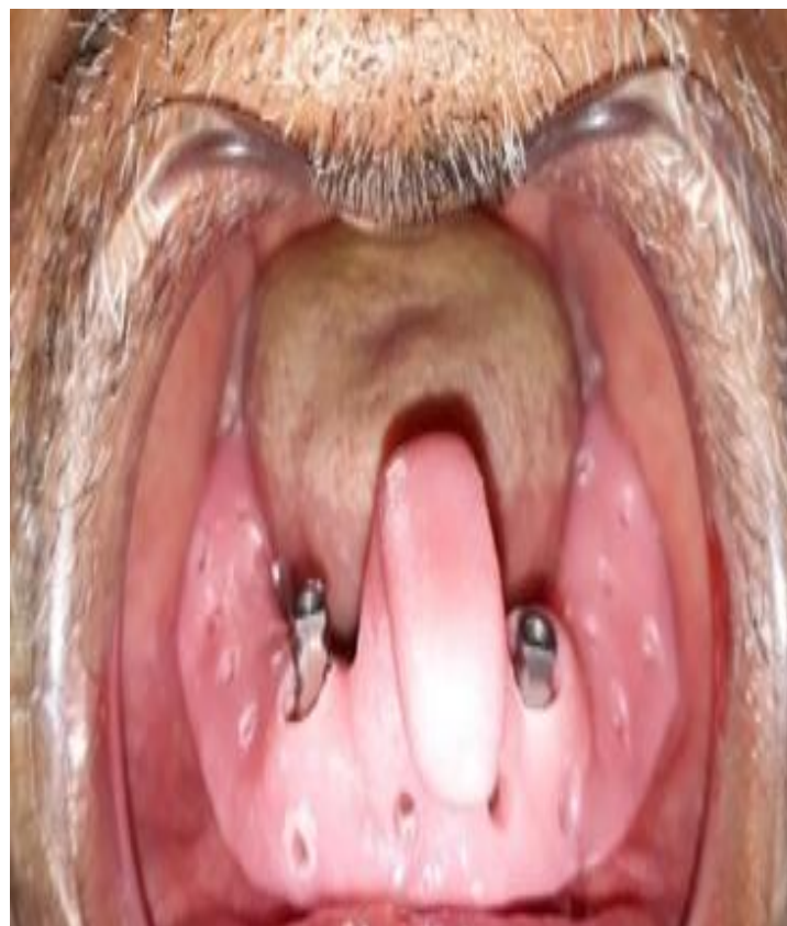
Fig 4 : Impression tray in mouth