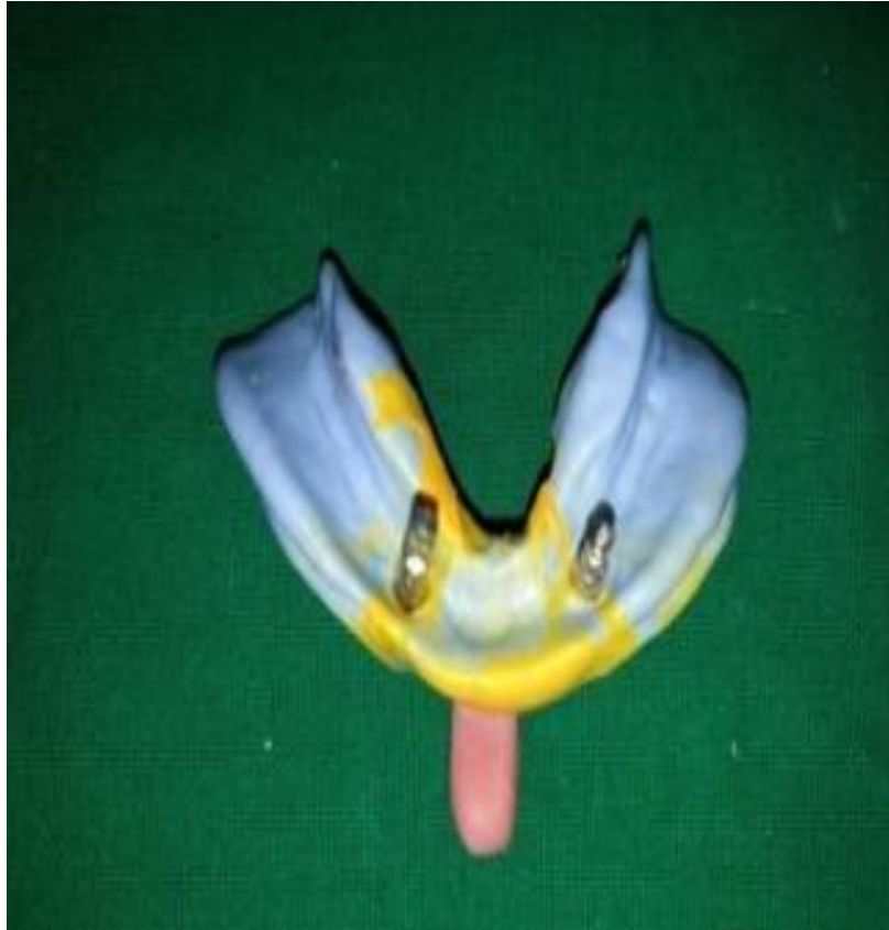
Fig 5 : Tray with impression