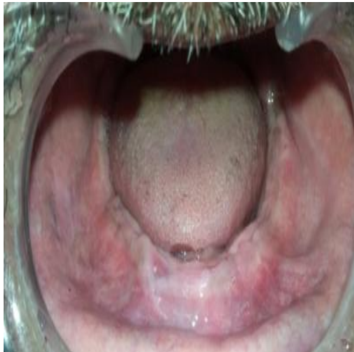
Fig 1: Edentulous mandibular ridge