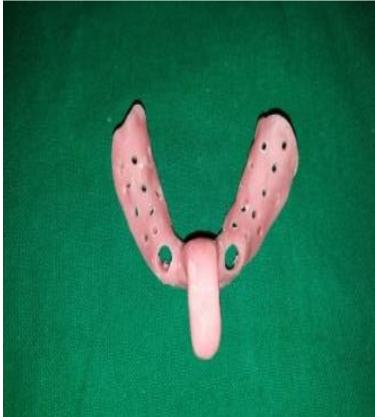
Fig 3: Acrylic tray with holes in bilateral canine region providing space for impression copings for open tray impression