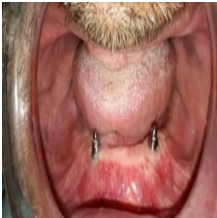
Fig 7: Ball abutments in place