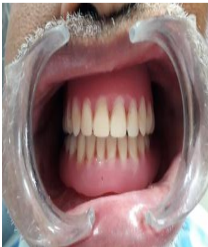
Fig 8: Complete dentures in place