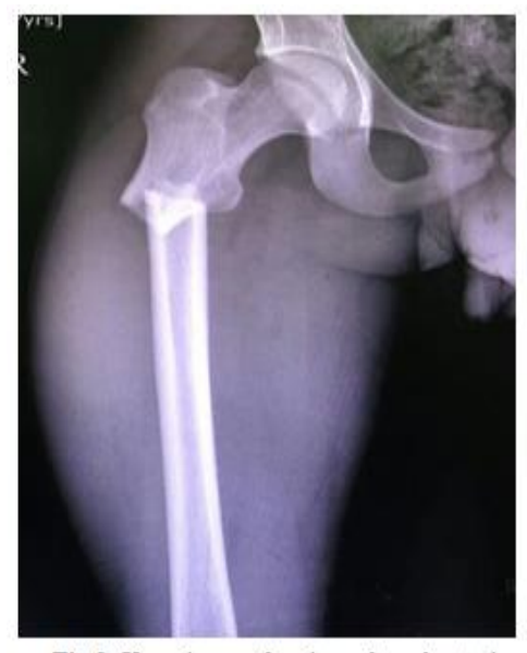
Fig 2. X ray image showing subtrochanteric fracture.