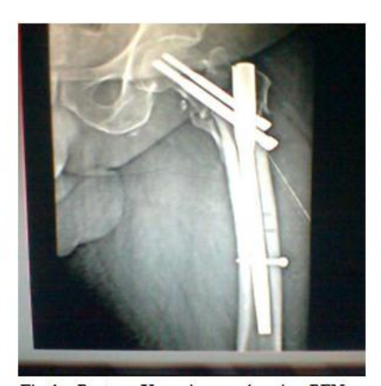
Fig 1a. Post-op X-ray image showing PFN