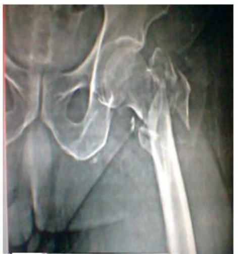
Fig 1. X ray image showing Intertrochanteric fracture fixation

There were 9 men which accounts for 60 % and 6 women which accounts for 40% of cases in this study with an average age of 46.5 years. Patients were followed up with X rays for a minimum of 6 months and maximum of 1 year period. The mean follow up was 9 months. At the end of the follow-up period fracture union was achieved in 13 (86.7%) patients of which 2 (13.3%) cases of delayed union were reported. We encountered 2 cases of non-union for which iliac crest bone grafting done which went for union, 1 case of superficial infection, 1 case of trochanteric bursitis. Minimal limp was noted in 3 patient.