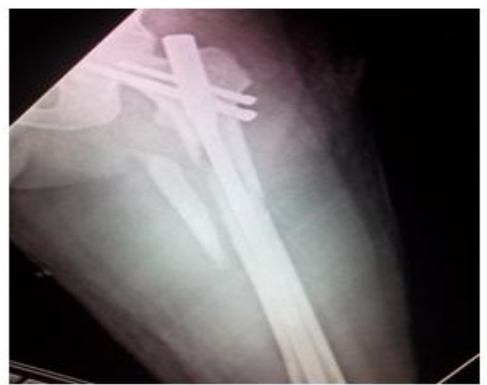
Fig 3a. Post-op X ray showing PFN fixation