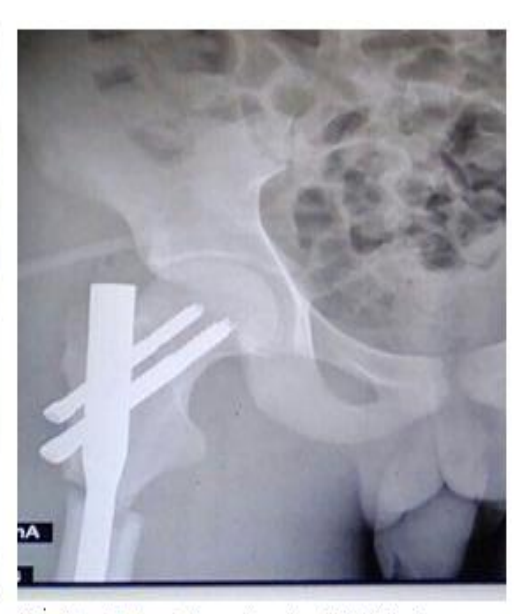
Fig 2a. Post-op X ray showing PFN fixation