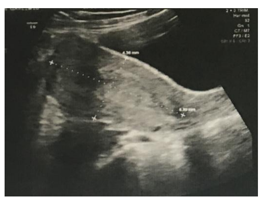
Fig 3. Empty uterine cavity