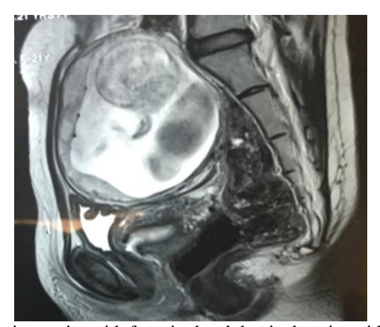
Fig 4. MRI showing empty uterine cavity with fetus in the abdominal cavity with no surrounding myometrium Hence the high risks associated with continuing the pregnancy were explained and the patient was advised to terminate her pregnancy. Patient was planned for exploratory laparatomy. Intra- operatively, gestational sac was in peritoneal cavity which was ruptured. Female baby weighing 475 grams was removed. Baby cried but succumbed immediately.