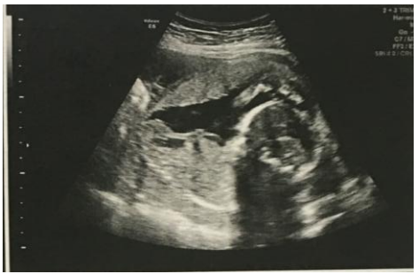
Fig 1 and 2. Ultrasound showing fetus in abdominal cavity with no surrounding myometrium