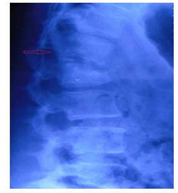
Fig. 1B: Preoperative lateral view of lumbar spine showing reduction in inter-vertebral disc space between L1 and L2 vertebra with localized kyphotic deformity.