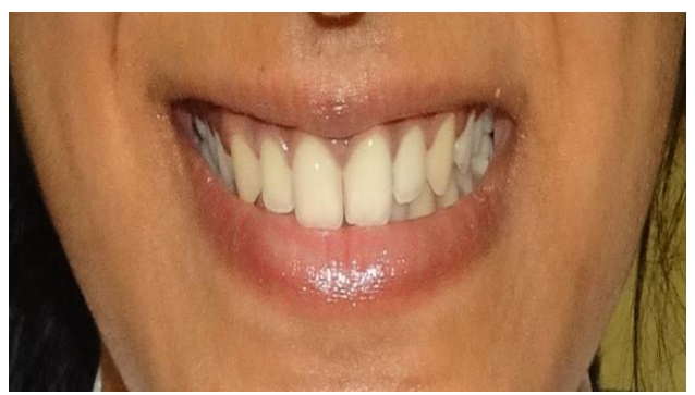
Fig.4. Excessive gingival display

Assessment of the questionnaires filled out by laypersons revealed that the reason for rating the smile in slide #2 as unattractive was due to excessive gingival display in the image. Maximum limit of gingival tissue exposure is 3mm. [11] Greater gingival exposure is considered unesthetic by layperson and Prosthodontist.