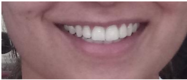
Fig.2.Consonant smile arc where incisal edge followed the lowerlip line were considered more esthetic

Morearched incisal contour gave the appearance of younger looking smile while straight smile arc gave older appearance. This factor should be taken into consideration while planning esthetic restorations i.e. crowns and veneers and/or rehabilitation with complete dentures. According to the second commandment, ideal maxillary w/h ratio of pleasant smiles were in the range of 75 % - 85%. It was observed values near the range of 75 % was commonly seen in women and values near the range of 80% was seen in men. Narrower teeth were considered more esthetic by layperson. During esthetic treatment, a Prosthodontist should determine whichcentral incisor follows proper W/H ratio and that should be used as template. If both are altered then height should be used as reference.