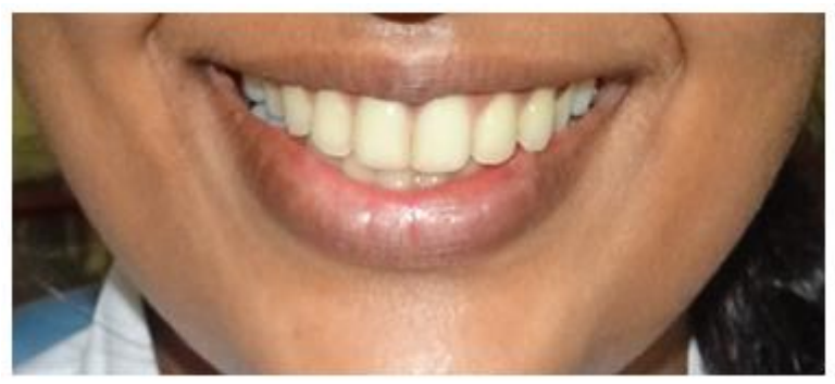
Fig 3. Smile with minimal display of gingiva

Morearched incisal contour gave the appearance of younger looking smile while straight smile arc gave older appearance. This factor should be taken into consideration while planning esthetic restorations i.e. crowns and veneers and/or rehabilitation with complete dentures. According to the second commandment, ideal maxillary w/h ratio of pleasant smiles were in the range of 75 % - 85%. It was observed values near the range of 75 % was commonly seen in women and values near the range of 80% was seen in men. Narrower teeth were considered more esthetic by layperson. During esthetic treatment, a Prosthodontist should determine whichcentral incisor follows proper W/H ratio and that should be used as template. If both are altered then height should be used as reference.