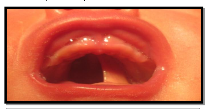
Figure 1: Intraoperative view of upper and lower fusion via fibours band

A 3 days old baby girl infant was referred to department of Oral and maxillofacial surgery in K.D Dental College And Hospital,Mathura, for examination and treatment. Initial examination shows upper and lower fusion (figure 1) i.e. A diffuse mucosal band extending from the floor of the mouth to the palate on left side and hard palateand impossibility of mouth opening for infant. Initial consultations with pediatricians and anesthetist were carried out and usual examinations were taken before the operation. General health of infant was confirmed by pediatrician. Also, no abnormality was reported in her family history. Surgical transection of the band was performed under inhalation anesthesia since endotracheal intubation was deemed too difficult. The mucosal banding was separated under conscious sedation with the aid of an electrocautery (figure.2). This releases the mandible and resulted in improved mouth opening. The band tissue was excised and sutured . Patient will be on long-term follow-up. The hard palate defect will be reconstructed at a later stage.