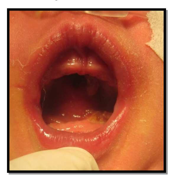
Figure 4: Postoperative photograph

In the case presented here, there was coexistence of intraoral synechiae and cleft palate. Intraoral synechia accompanied by cleft palate was first described by Fhurmann et al3 in 1972 as cleft palate lateral synechia syndrome. It composed of mucosal banding from the floor of the mouth to margins of the cleft and micrognathia. There is great variability in the expression of the banding, which ranges from a thin friable membrane to thick mucosal bands. Furthermore, intraoral synechia may be a component of many syndromes, such as van der Woude, popliteal pterygium, and Fryns syndromes. Alveolar synechiae in conjunction with a cleft palate is known as lateral alveolar synechiae syndrome. Cleft palate lateral synechia syndrome (CPLS) was first described by Fuhrmann and colleagues (1972) in a case series of 5 members of a family who presented with cordlike adhesions running from the free borders of the palate to the lateral parts of the tongue and floor of the mouth (Preus et al., 1974; Haramis and Apesos, 1995).