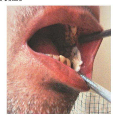
fig.2: Verrucous lesion on left buccal mucosa