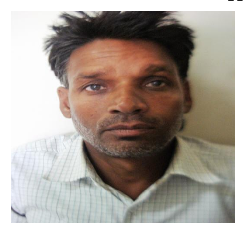
fig.1: Profile picture