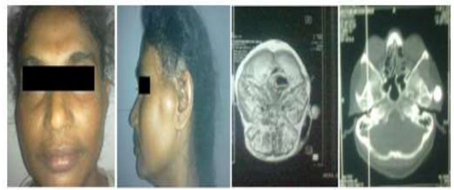
Figures: showing osteoma of the zygomatic process of the left temporal bone

A 38 years old female presented with a slow growing swelling in the left pre-auricular region for last 3 years. There was no history of any trauma or infection. Neither there was any pain over the swelling nor there any earache. On examination, the swelling was about 2 cm×1.5 cm×2.5cm, non tender, stony hard, smooth with well defined margins. The overlying skin was normal in colour with no signs of inflammation and was non adherent to the swelling. The General, Systemic and rest of the ENTexaminations are within normal limit. The routine blood investigations are also within normal limit and USG abdomen reveals no significant finding. CT scan reveals a well definedhyperdenseexophytic lesion about 1.99cm×1.46cm×2.29cm in its antero-posterior, transverse and craniocaudal dimensions respectively arising from the outer table of the zygomatic process of the left temporal bone suggestive of osteoma.