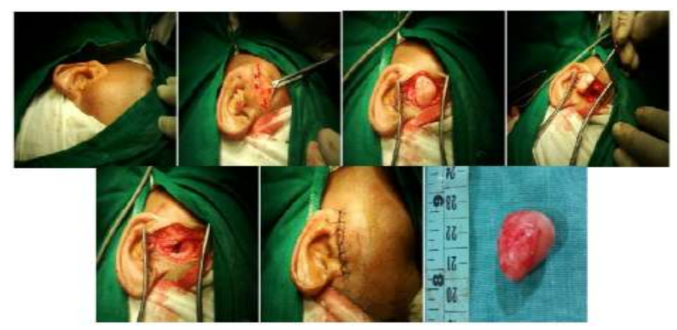
Figures: showing various steps in removal of the osteoma