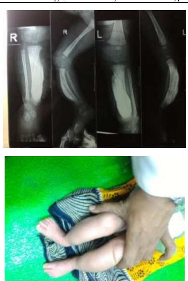
Figure 1 x - ray of 3 day old child and clinical picture showing hyperosteosis of bilateral tibia