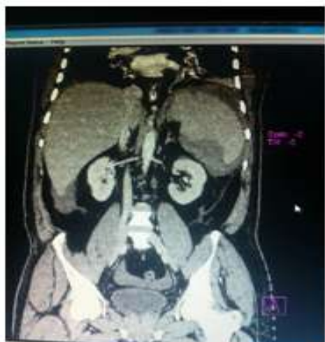
Enhanced CT Scan Of The Abdomen(Longitudinal) Shows Perisplenic Hematoma.