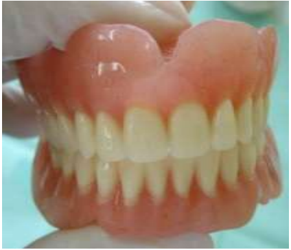
Fig. 4: Completed denture.

During the final preparation process of BPS denture, in order to keep constant bilateral balanced occlusion relation, we established a polymerization procedure as in the SR-IVOCAP pressure system [5,22,24]. In this system, the polymerization is preceded in layers from down-up. This provides no deformities of the denture after polymerization, avoids alterations of occlusal relation, interferences, pores in resin and leads to a more exact adhesion of the denture and mucosa ( Fig.4 ) [3,6,10,19].