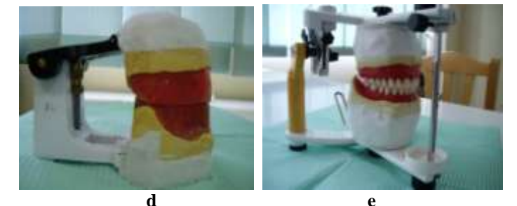
Fig.1: a-Impression and working casts, b- positioning of casts in central tray, c-repositioning in articulator, dpreparing the individual trays and bite templates in central, e- wax up denture trial.

As functional impression technique, we used for the first time the individualization and personal registration of the Postdam Area. This concept is primarily introduced in this technique which upon now was recognized as a single line; the Postdam or Vibration Area represents the area where the soft and hard palate combine. In this area, the mucosal tissue shows a high resilience. The Postdam makes up for the most important zone in determining the stability and posterior adhesion of the upper denture.