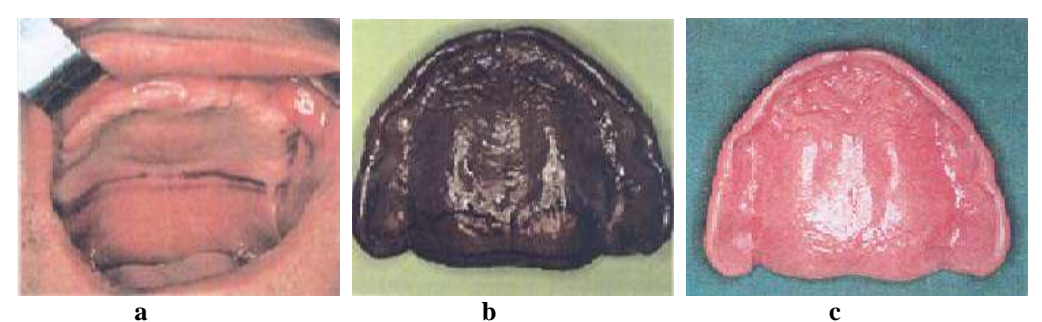
Fig 2: a- high resilience vibration zone, b- functional recording of the Postdam area, c- reflection of the vibration zone in the final denture.

mucosal tissue in the vibration area, by acting as a barrier for air pressure, similar to the gouge process in