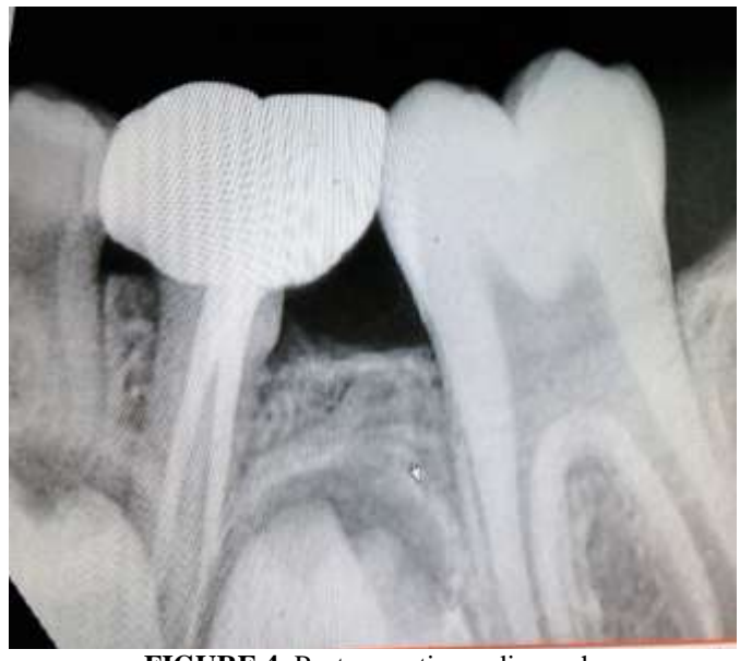
FIGURE 4 : Post-operative radiograph