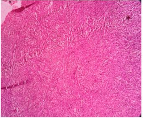
Figure 3: 10X view, showing spindle cells arranged in fascicles or showing storiform pattern.