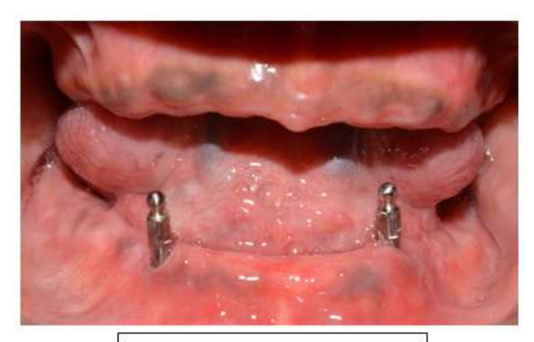
Fig. 13. Review after two months