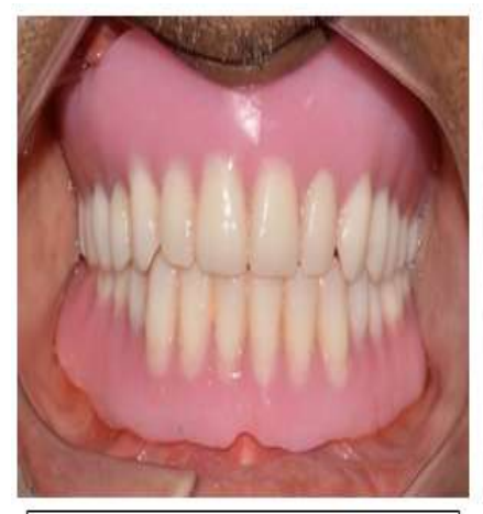
Fig.11. post insertion after implants placements