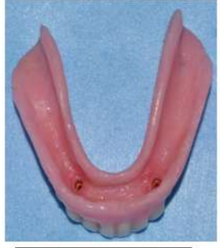
Fig. 10. Intaglio surface witho-ring attachments