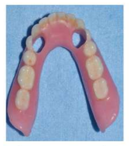
Fig. 9. Preparation of denture