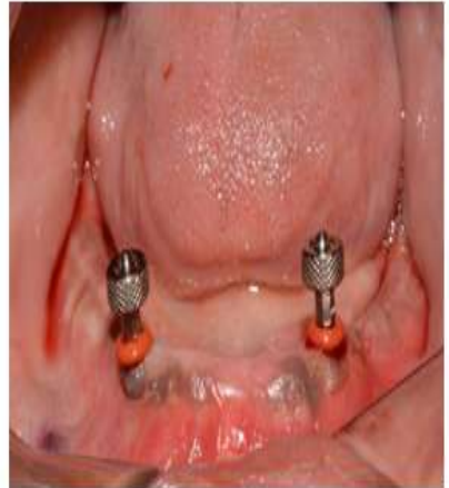
Fig. 7. O-ring attachments