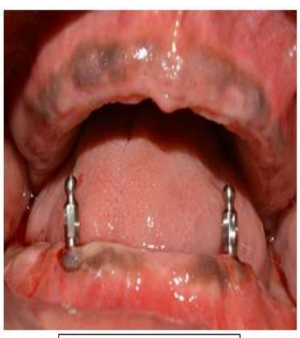
Fig. 6. Implants placement