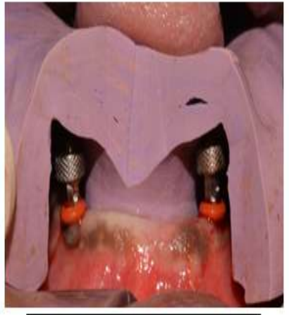
Fig. 8 Putty matrix placed after implants placements