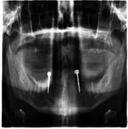
Fig. 12. Post Insertion Opg