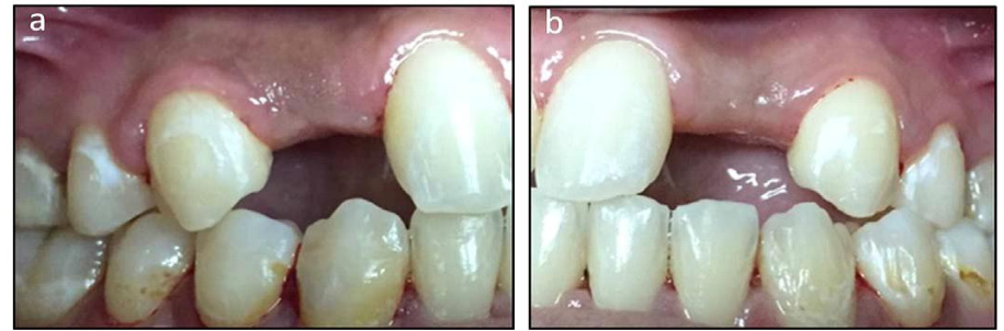
Fig. 2 Lateral view of missing maxillary right (a) and left (b) lateral incisors.

Mesiodistal space of the left lateral incisor region was also slightly wider than the contralateral side causing asymmetrical concern. The maxillary lateral incisors sites had sufficient interocclusal clearance but the thickness of the labial plate appeared quite thin in which great caution was deemed necessary if implant placement is in mind, All the treatment options had been discussed ranging from removable denture, resinbonded bridges, conventional bridges to implant-retained prosthesis. With all factors taken into consideration, the missing lateral incisors would be replaced with indirect 2-unit cantilever fibre-reinforced composite bridges. Both central incisors were chosen to be the abutments. Patient was made aware of the risks and limitations of resinbonded bridges and frequent follow up over the years. Fig. 2