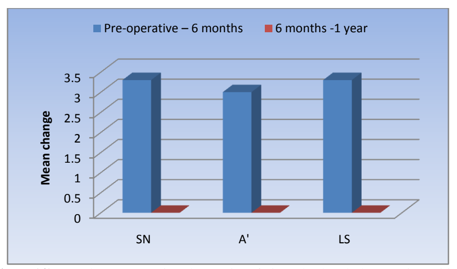
Figure (2): Bar chart representing changes in soft tissue landmarks by superimposition