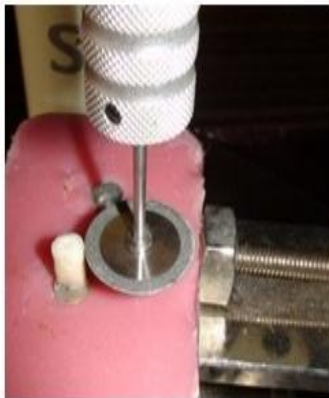
Fig-3-Sectioning the specimen