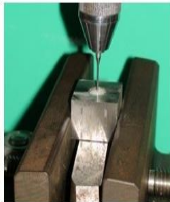
Fig-4-Testing bond strength