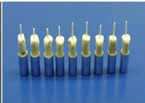
Fig-2-Group B Specimens