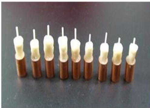
Fig-1-Group A Specimens